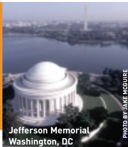
Jefferson Memorial Washington, DC

out and return the business reply card in the travel section or visit GHTravel.com .