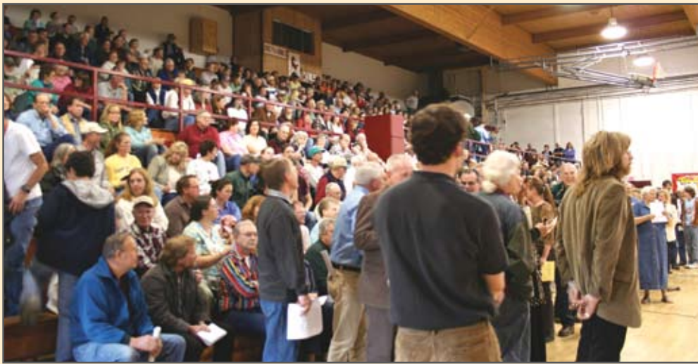
On April 12, 2006 more than a thousand Ravalli County residents gathered to encourage the enactment of Interim Zoning Resolution 1844.